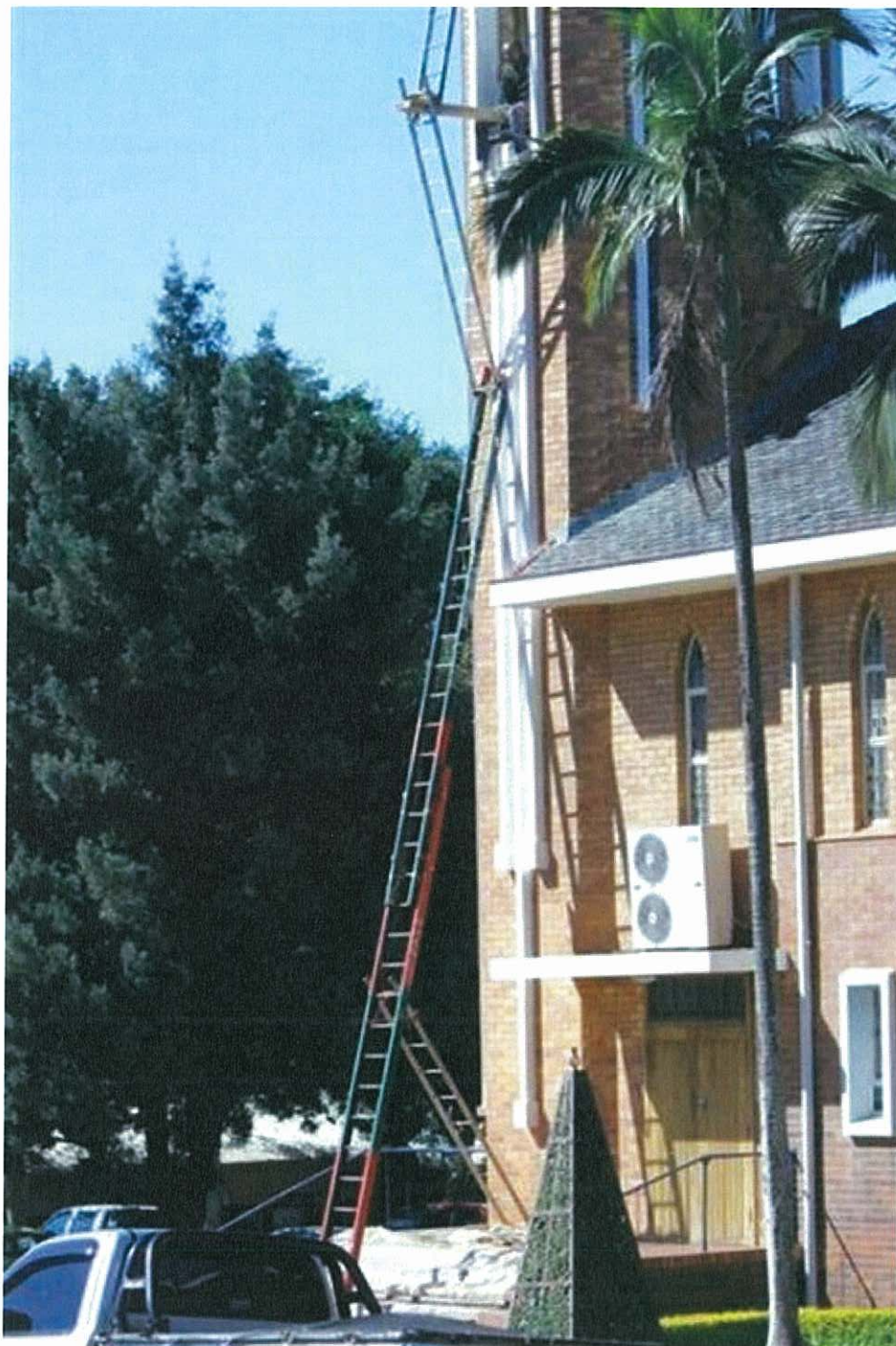
..Although not quite, the first ladder is even longer! definite Death Wish

What ingenuity! The chances of this going wrong are about as high as they go, In fact we wonder which route up the ladder our man took? Did he climb the outward facing second stage? or did he clamber over the human counterweight? ....if only an aerial lift had been available. A definite Death Wish.